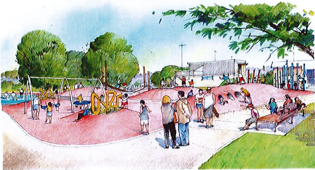
Sketch of the new playspace at Marlborough Park

Access to the park will be restricted at times during this period so please follow signs in place accordingly. Access to the tennis club and other facilities via the carpark and Archers Road entrance will be maintained throughout the works period.